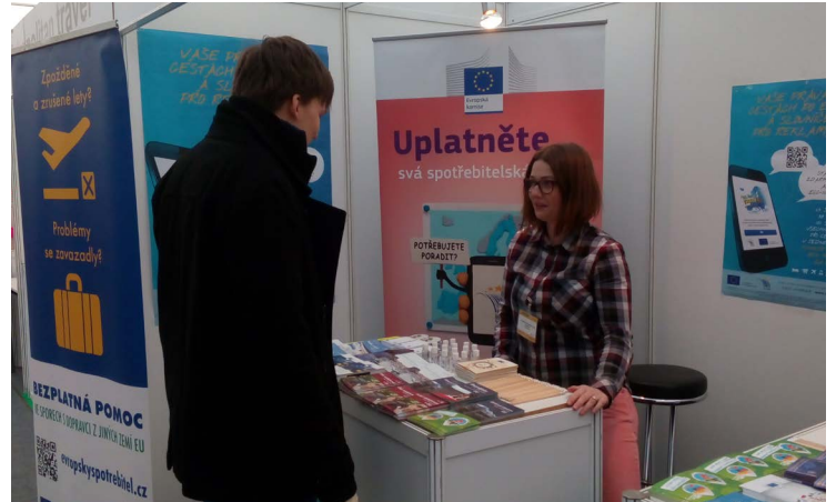
Czech ECC offers its information on consumer rights for example at various travel trade fairs. This picture is from Holiday World in Prague.