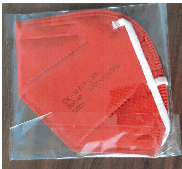
Picture of the product

Product name: Filtrační polomaska MOLAXISI Trademark: MOLAXISI Model type / number: 1901TX Production serie number: 02/2021 Identification data of importer: not displayed Identification data of manufacturer: Molasses (JILIN) biotechnology Co., Ltd, 1/f, Workshop 1 No. 188 Yinfu Road, Jingyue Development Zone, Changchun, Jilin, China