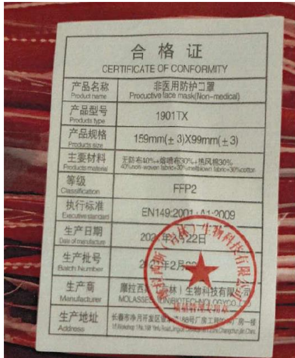
Picture of the product leaflet